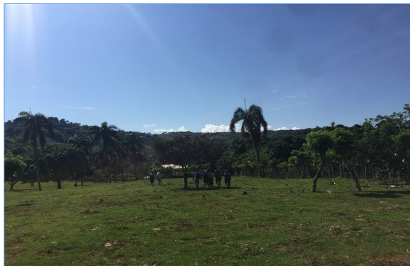
Picture above shows the view of the land from prayer mountain toward Pastor Chalas house